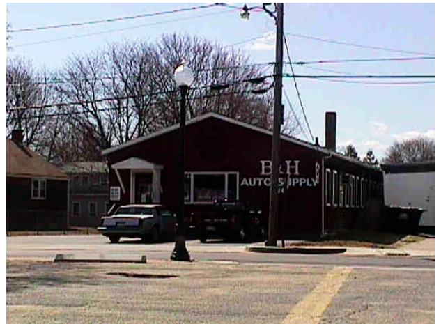
( http://images.vgsi.com/photos/MiddleboroughMAPhotos//\00\00\63\84.jpg )